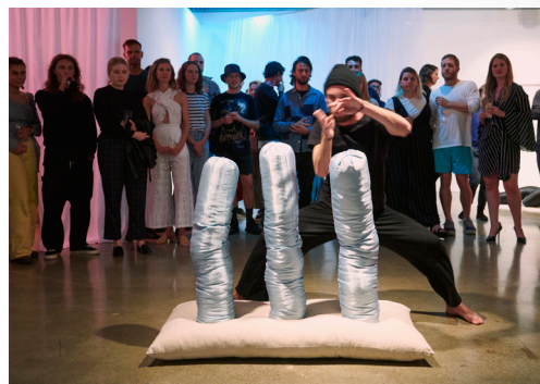
TOP TO BOTTOM MAIN GALLERY MAIN GALLERY